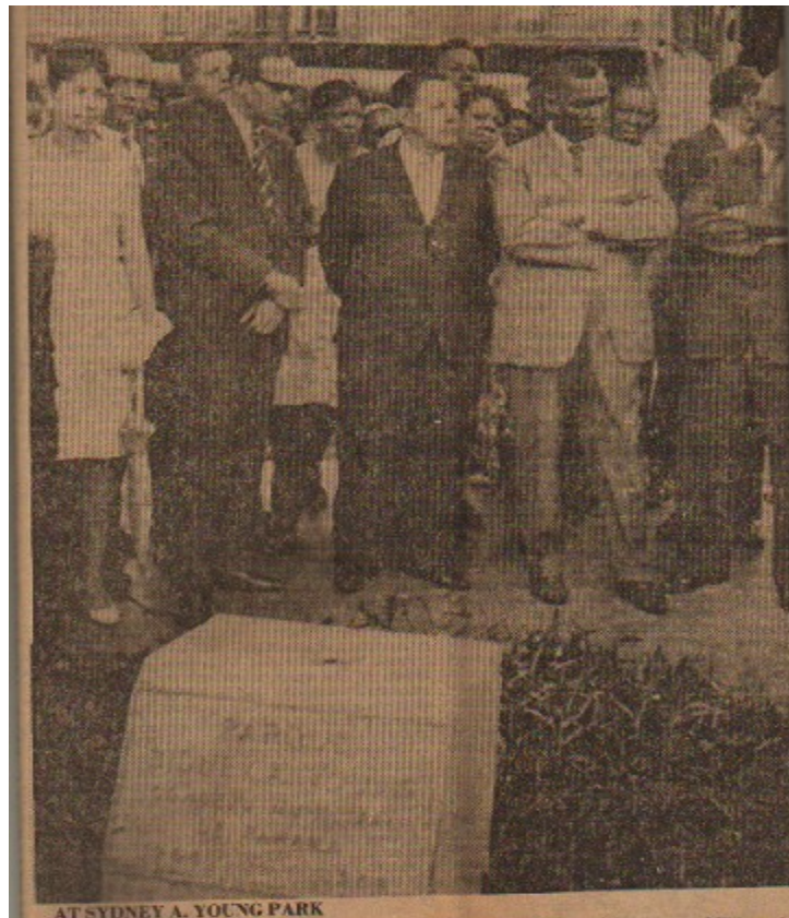
AT SYDNEY A. YOUNG PARK