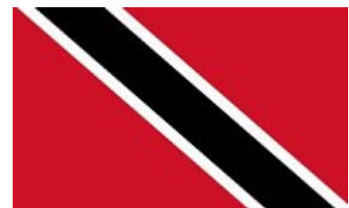
TRINIDAD & TOBAGO

Nothing is perfect and there will always be unfinished and new business to be taken care of and the only way to get them done is pushing and shoving non stop.