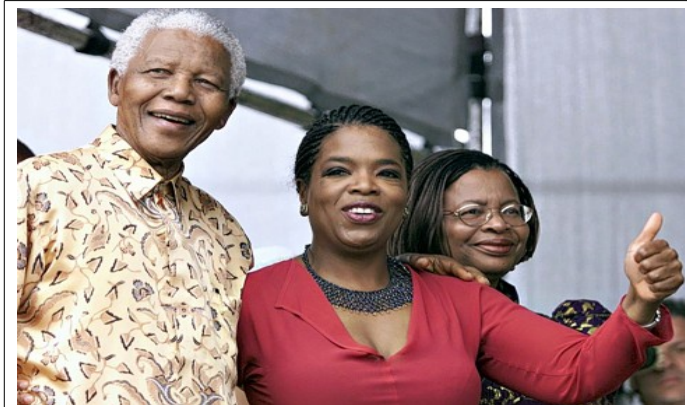
Oprah is wearing Panamanian beads at her meeting with Madiba

"I can rest only for a moment, for with freedom come responsibilities, and I dare not linger, for my long walk is not yet ended." (From Long Walk to Freedom , 1995)