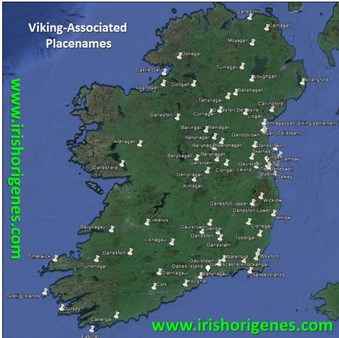
Figure 1: Viking towns, placenames and townlands. An examination of the location of Viking towns and placenames reveals them concentrated within Eastern, Southern and Central Ireland.

many Irish placenames are a clear reference to surnames that arose in that area and one can examine for example Doyle farmer locations together with Doyle placenames and see a clear correlation, see Figure 3 . Hence, if you have a Viking-associated surname linked to an area of Viking settlement (identified in Figure 1) then one may in fact have genuine Norse ancestry. Ultimately only modern commercial ancestral Y-DNA testing can determine whether one's recent Irish ancestor was of genuine Viking origin.