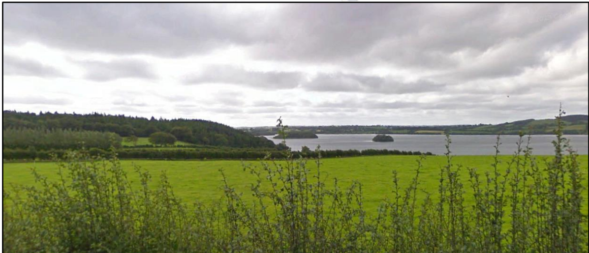
Figure 4: Turgesius Island on Lough Lene. Turgesius Island (centre) and Nuns Island (right) are located on the southern end of Lough Lene in County Westmeath. Although it was the abundance of religious settlements like Nuns Island that first attracted the Vikings to Westmeath it was the lakes and rivers which may have enticed the water loving Norse to stay.

In that text the Vikings are described as the 'Lochlonnaigh' which evolved into the Irish surname 'Lochlan' meaning 'People of the Lakes.' Today, the surnames Loughlin and McLoughlin are found amongst the farming community of neighbouring Meath and Longford respectively. Many other Viking surnames including Dolyes and Rourkes are found throughout Westmeath and bordering areas. While it was the abundance of Religious settlements in Central Ireland that first led Viking raiders to this area, it may have been the abundance of rivers and lakes which led them to settle permanently.