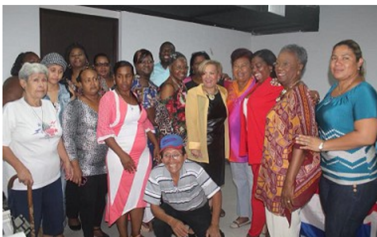
PRD Women innaugurate International Decade for People of African Descent.

At least one political party in Panama is paying attention to the United Nations' call and is promoting the innauguration of the International Decade for People of African Descent .