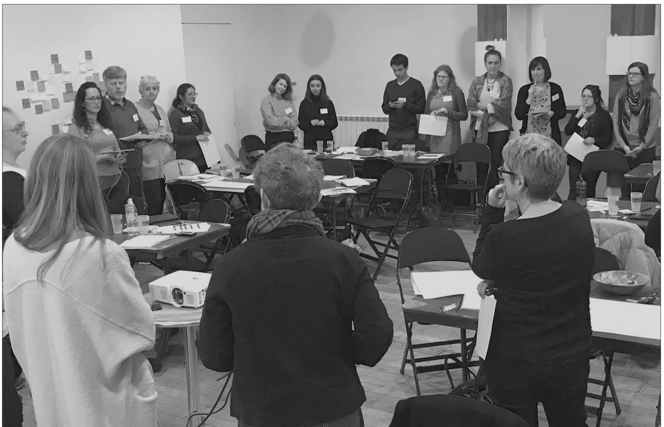
LGR6 participants collaboratively reflecting

//////////////////////////////////// 'Organisations that can adopt these lower-scale digital approaches alongside the ability to recognise and articulate how they contribute to social purpose are excellent examples of best practice.' //////////////////////////////////////