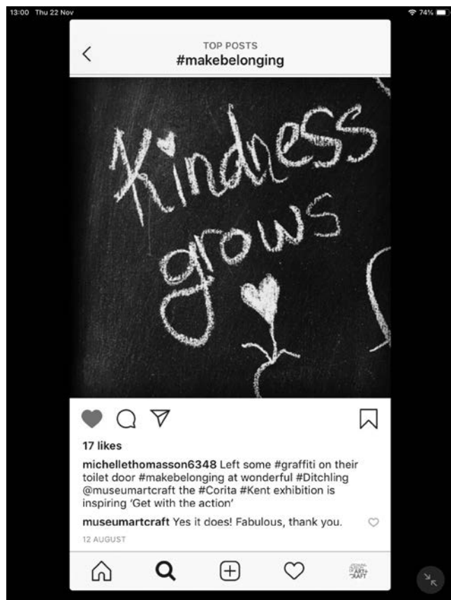
Ditchling Museum exploring analogue and online reflections on belonging

In contrast, the Barbican team was surprised by the level of response that opening up digital avenues to individual voices attracted. Using Twitter, Facebook and Instagram, the Barbican presented a series of statements, questions and responses to their audiences. They experienced a phenomenal response to the prompt, 'If I could change one thing in the arts...'. The type of response was also surprising, as many people shared in-depth personal and emotional responses. The experiment showed the importance of not just valuing the 'audience voice', but actively calling out and engaging with it. LGR6 participants from the Barbican are now considering how they might action the feedback—'Artspeak' being a barrier to accessing art, for instance. The experiment has also informed how the Barbican could use social networks to create a place for active audience voice and discussion, rather than simply talking at audiences in order to sell tickets.