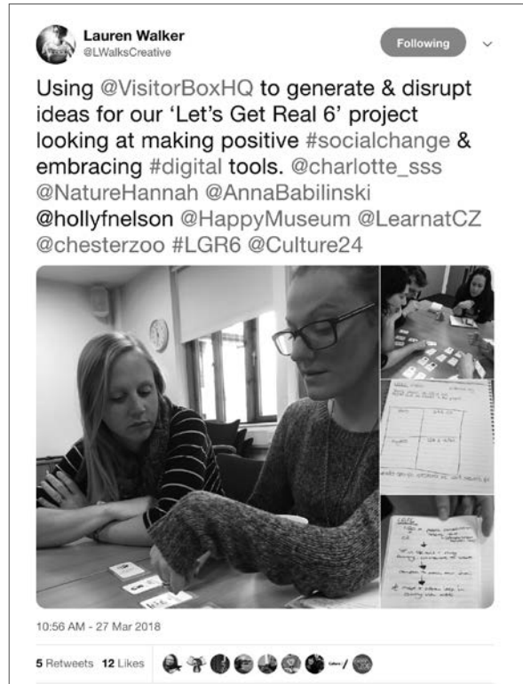
Chester Zoo developing their LGR6 experiment idea

Participants were asked to form LGR6 working groups within their organisations, nominating colleagues from other roles or departments to work and consult with on the experiments. In this way the experiments sought to uncover organisational opportunities and challenges as well as personal ones.