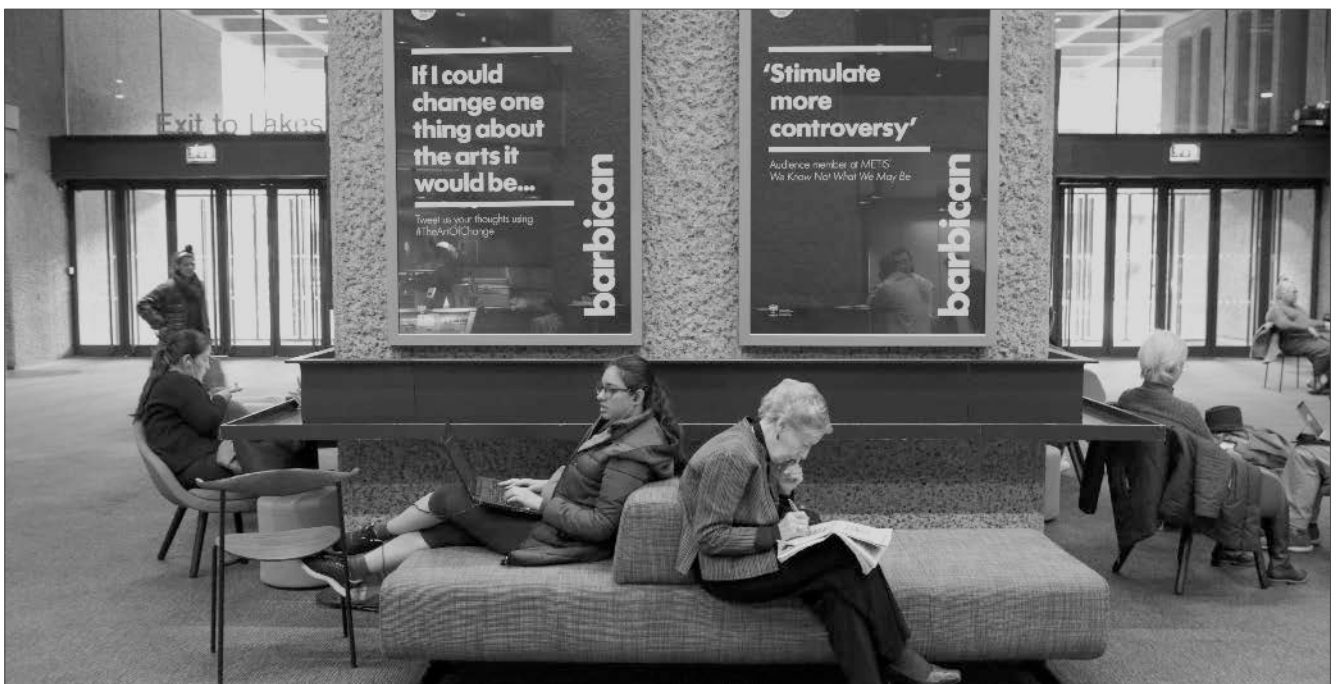
The Barbican providing a platform to showcase people's voices, ©Barbican