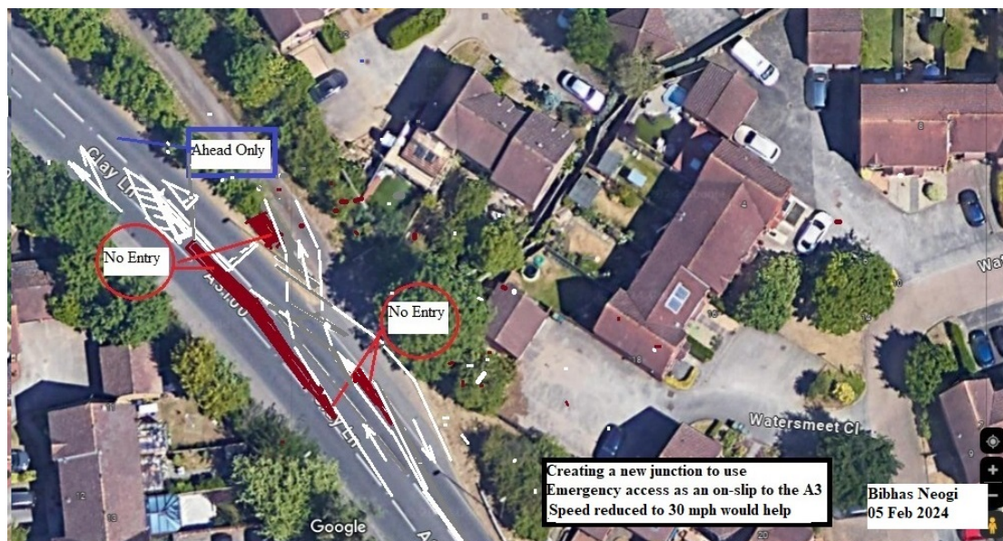
Alterations to the junction of Clay Lane and emergency access to the A3

The emergency access from Clay Lane on to the southbound carriageway of the A3 could be altered to form this on-slip access. SCC could explore the possibility of the necessary changes. It would require alterations at the junction with Clay Lane and other restrictions on turning of traffic into and out of Burpham Lane. The sketch below shows the possible layout of the road markings and creation of islands to house traffic signs.