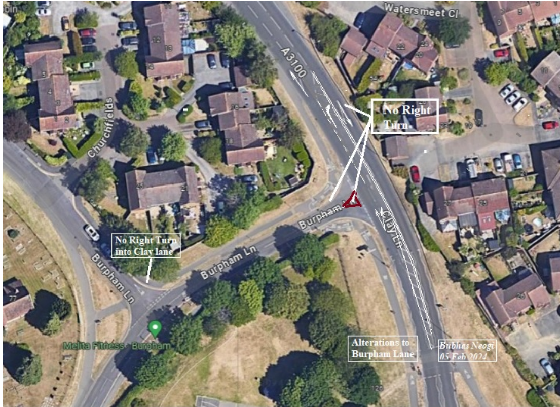
No Right turn into and out of Burpham Lane at the junction with Clay Lane

The traffic instead of turning right into Burpham Lane would proceed to the roundabout and turn around and then turn left into it. Traffic would be directed to go towards the roundabout on London road by Aldi Supermarket and then follow London Road northwards to Clay Lane.