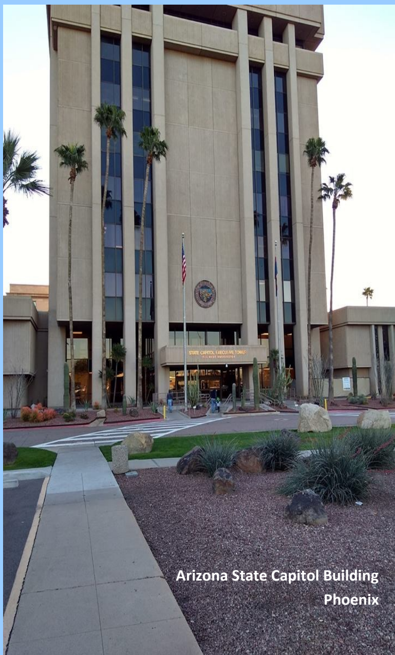
Arizona State Capitol Building Phoenix

The second issue concentrated on increased funding for the Long Term Care Ombudsman program. A Long-Term Care Ombudsman is a specially trained advocate for residents of long-term care facilities, which include nursing homes, assisted living facilities, and adult foster care homes. Ombudsmen seek to improve the quality of life, care, and environment for long-term care residents and work to resolve problems individual residents face. The Institute of Medicine recommended in 2009, that there should be one paid FTE Ombudsman for every 2,000 licensed beds. Currently in Arizona, there are nearly 20 professionals serving as Long-Term Care Ombudsmen. At current staffing levels, there is one Ombudsman for every 2,773 beds in Arizona, well above the recommended amount. In some regions there are over 3,500 beds