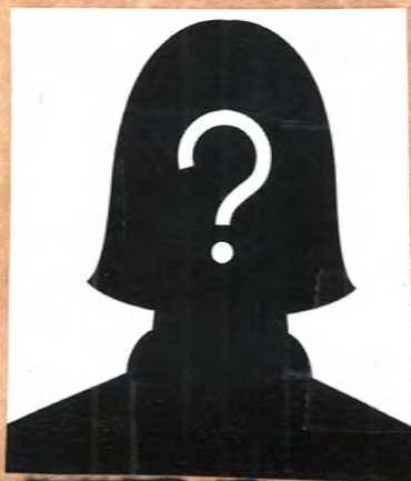
Testified against superiors

Lt. [redacted] a 17-year veteran who supervises firearms training. He joined the academy in 1971 and is also a member of the SWAT unit.