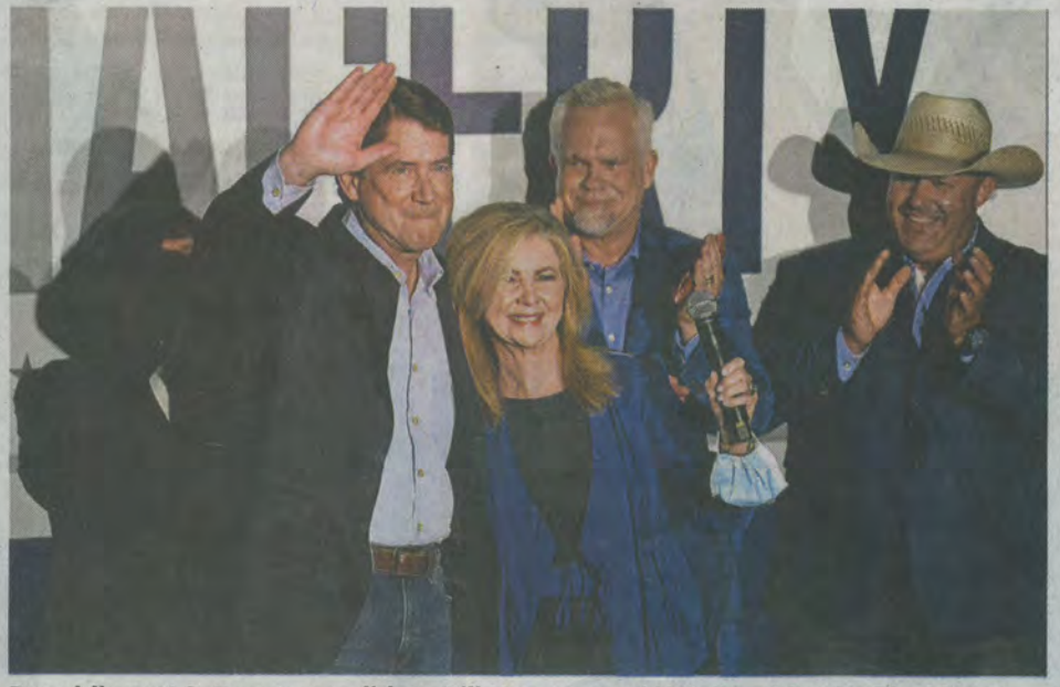
Republican U.S. Senate candidate Bill Hagerty and U.S. Sen. Marsha Blackburn, R-Tenn., wave to supporters at his election night watch party Aug. 6, 2020 in Gallatin, Tenn.