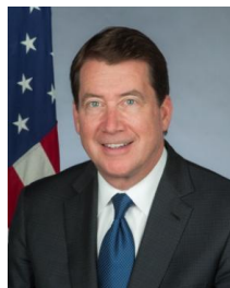
Sen. Bill Hagerty - Boy Scouts Board - Ex-Pinn- acle Fin. Partners Board – MBA - HH Father – St. George's Episcopal