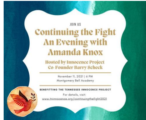
The Innocence Project At MBA