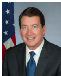
Sen. Bill Hagerty - Boy Scouts Board - Ex-Pinn- acle Fin. Partners Board – MBA - HH Father – St. George's Episcopal