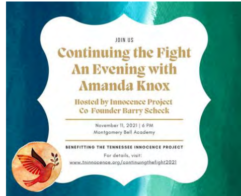
The Innocence Project At MBA