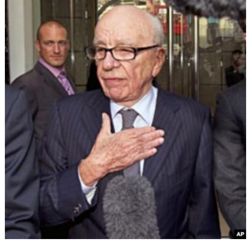
Rupert Murdoch - July 15, 2011 - Nine years and five days before the brutal murder of 18-year-old, Grant Solomon to cover-up child sex abuse.