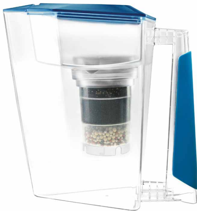
Table Water Filter System