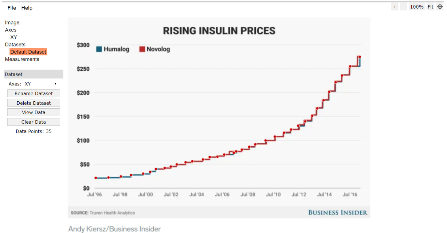
Figure 1 - Graph by Andy Kiersz/ data from Truven Health Analytics / Published in Business Insider (2017). Data collection shown by red dots taken with WebPlotDigitizer.