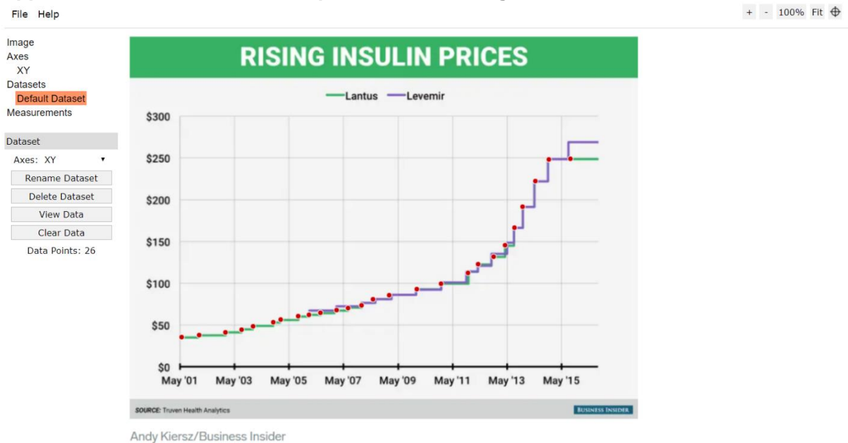
Figure 3 - Graph by Andy Kiersz/ data from Truven Health Analytics / Published in Business Insider (2016). Data collection shown by red dots taken with WebPlotDigitizer.