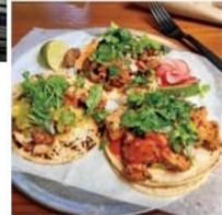
Clockwise from far left: Safe and splendid harbor at Bannister's Wharf; Redwood Library's 18th-century welcome; the spice of life from Tallulah's Tacos; a plain air screening at newportFILM