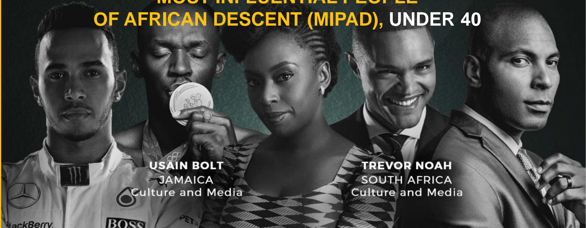
USAIN BOLT JAMAICA Culture and Media