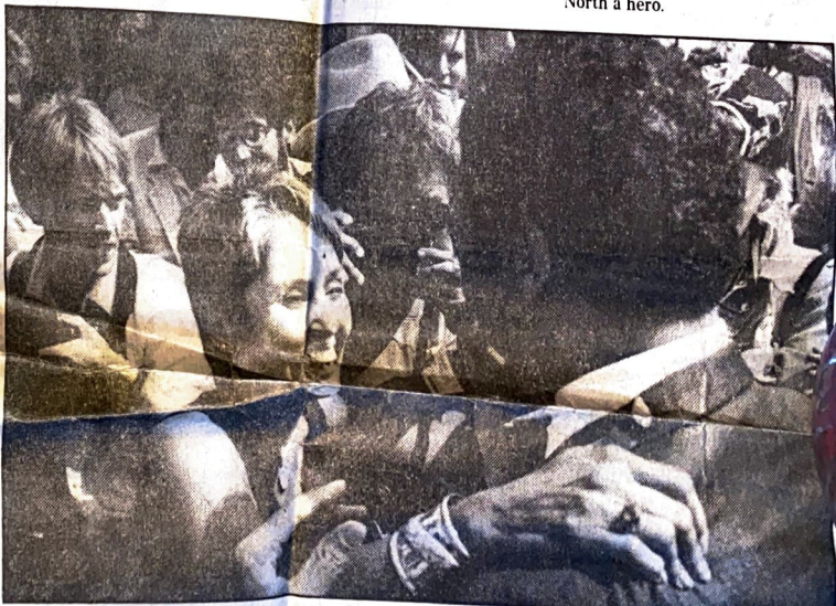
Singer Joan Baez greets the Rev. Jesse Jackson at protest rally near the Concord naval station