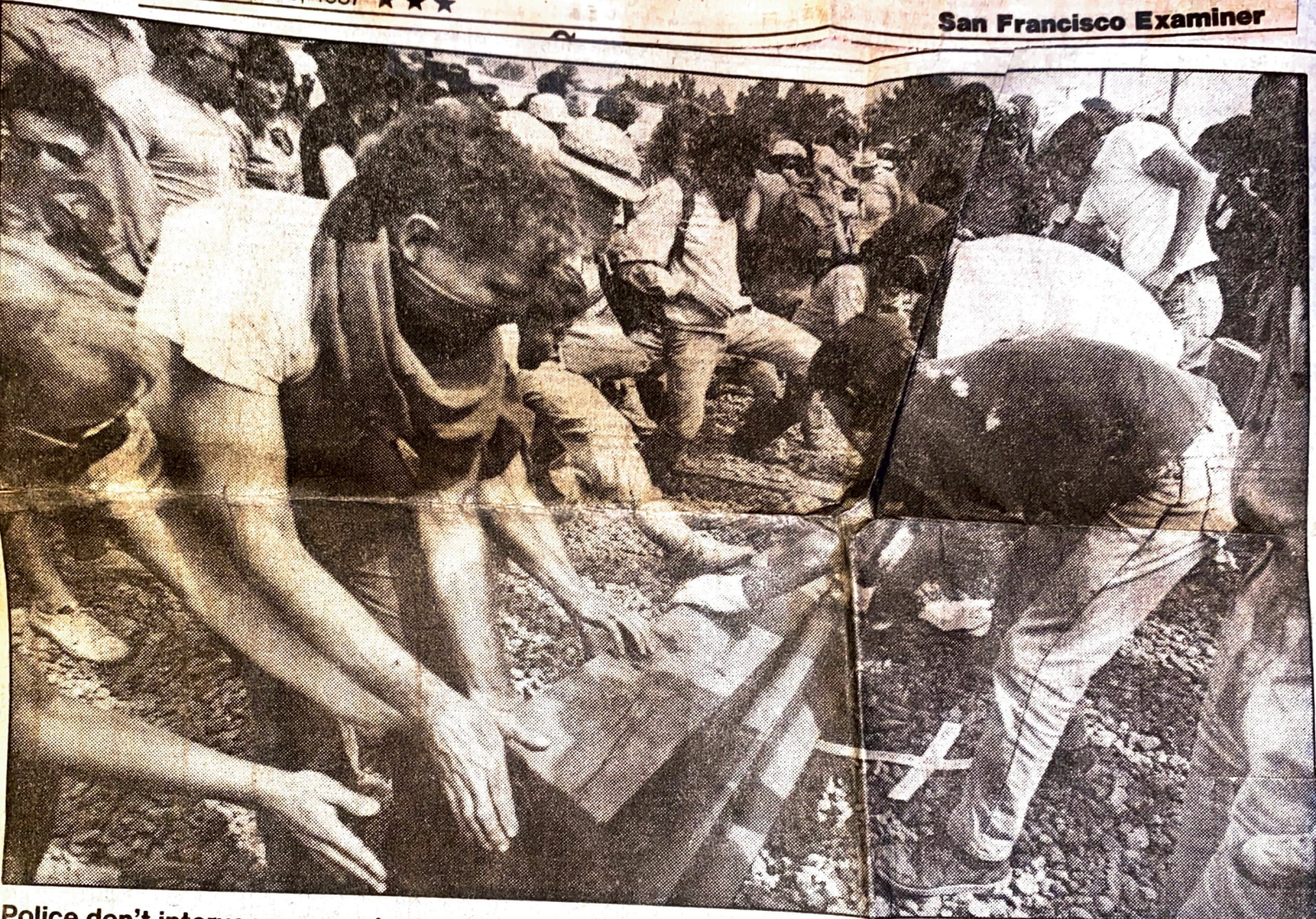
Police don't intervene as masked protesters rip up 300 feet of rails just outside naval station's main gate