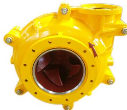
Tobee® THF Horizontal Froth Pump

Note: * Product specifications are subject to regional variations.