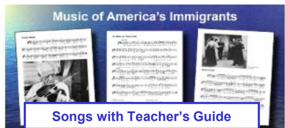
Songs with Teacher's Guide

For instructions on how to join our Social Legacy Network, visit us at