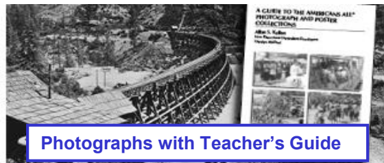
Photographs with Teacher's Guide