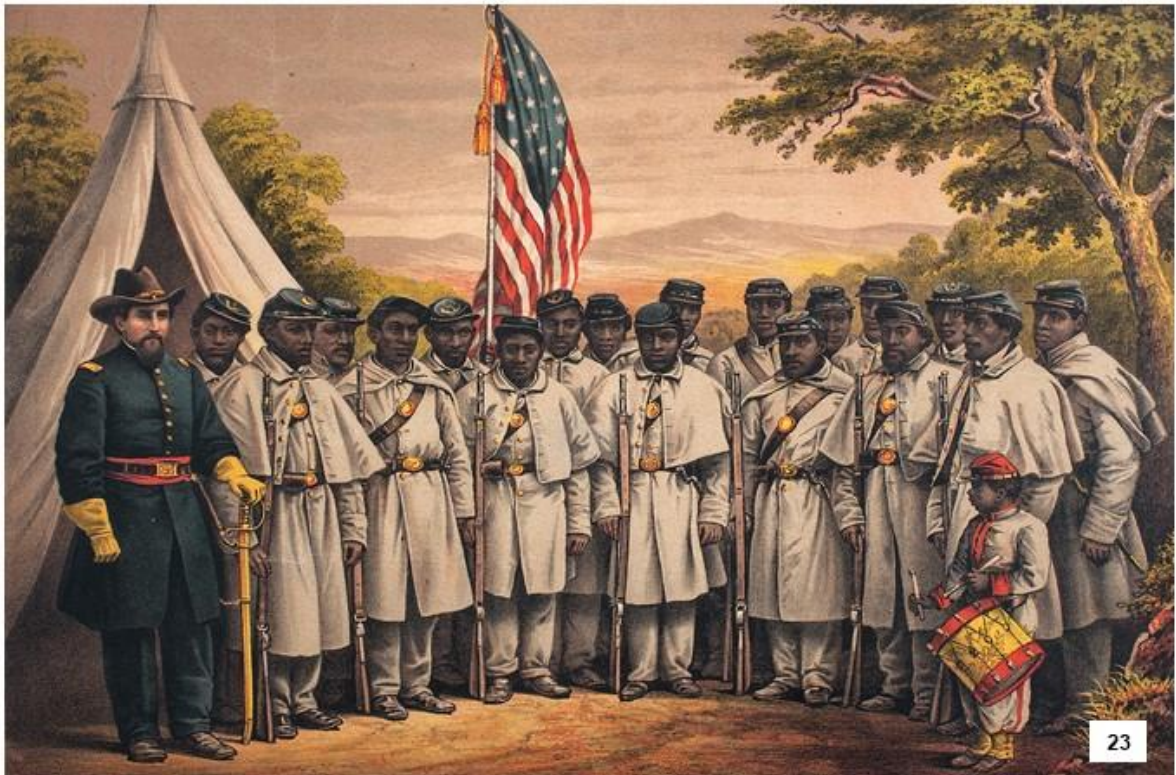
17. Robert Smalls, c. 1875; 18. The steamer Planter , c. 1861; 19. Harriet "Minty" Tubman, c. 1885; 20. Susie King Taylor, 1902; 21. Elizabeth Van Lew, unknown; 22. New England Hospital for Women and Children, unknown; 23. Union recruitment poster, titled called "Come and Join Us Brothers," c. 1864.