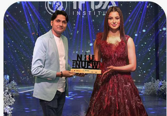
Accounts & IT Training Institute of Delhi

We are truly overwhelmed by this chance that we have has received this honourable award by industry expert