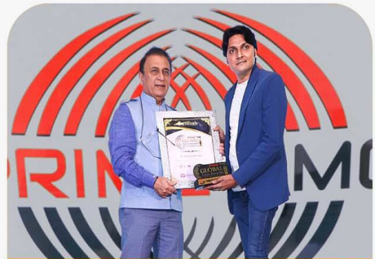
Entrepreneur Of The Year 2021-22