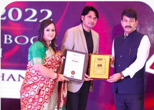
Best Accounts & IT Training Institute