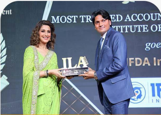
Most Trusted Accounts & IT Training Institute